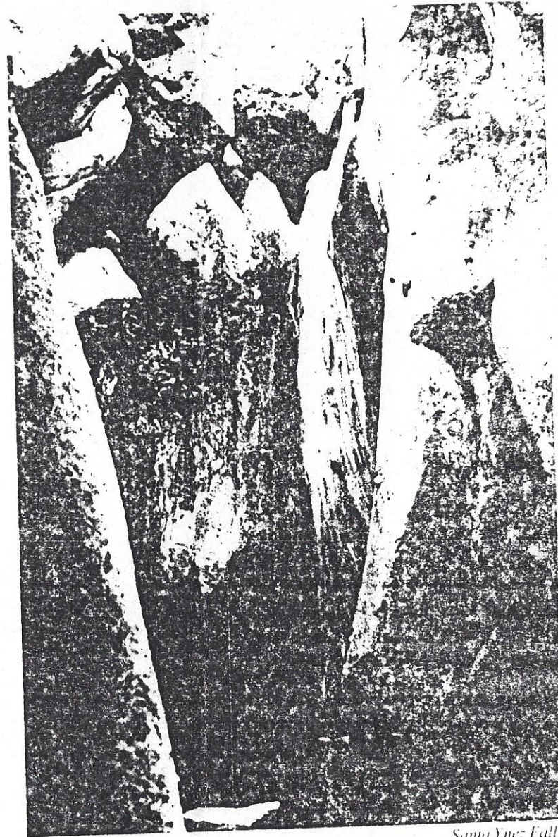
Santa Ynez Falls